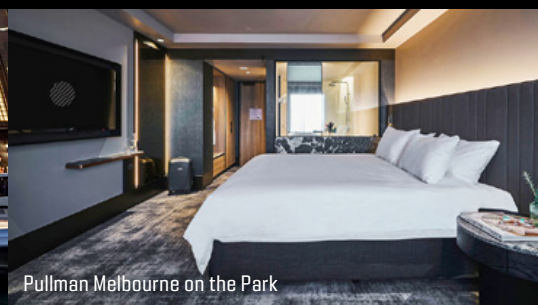
Pullman Melbourne on the Park

Located a quick tram ride from Melbourne's city centre, the MCG is easily accessible to a collection of world class hotels and apartments. AFL Event Office has a selection of quality accommodation options available, to help you plan a Grand Final weekend to remember. To find out more, visit afl.com.au/eventoffice or call our experienced team: 1300 235 235 (within Australia).