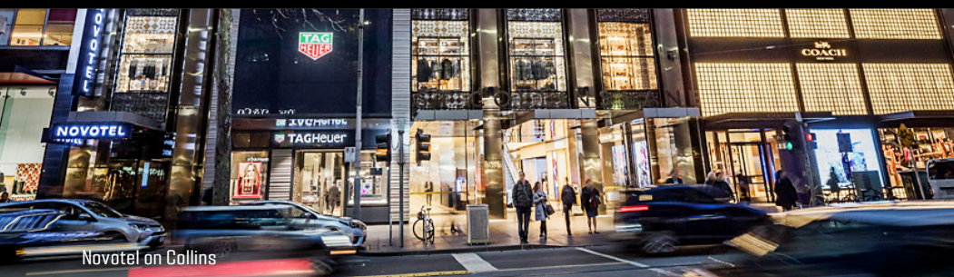
Novotel on Collins